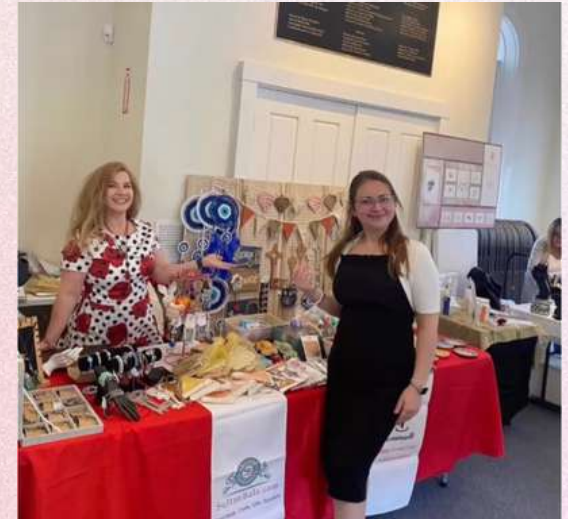
Jewelry Sale by BTF Boston Circle