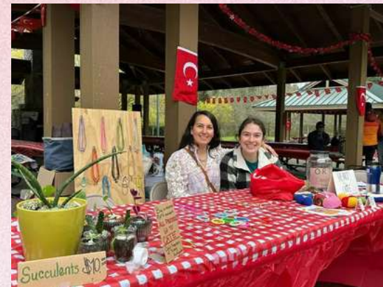
Knit Sale by BTF Portland Circle & BTF Youth