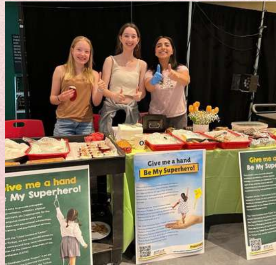
Lunchbox Charity Sale by BTF Portland Circle & BTF Youth